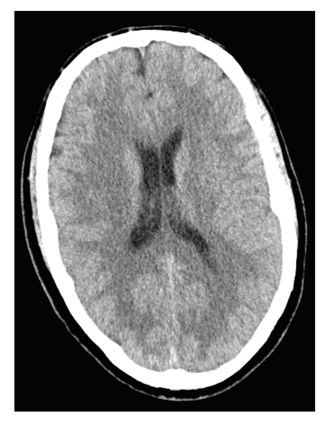
Figure 2. Computed tomography (CT) of the head was negative for intracranial bleed and did not show any anoxic encephalopathy.

three times per week. However, his blood urea nitrogen and serum creatinine levels still failed to improve, and he remained in a state of metabolic acidosis. On day 14 of his admission, the patient's condition deteriorated 2 h in dialysis treatment. He lost his gag and cough reflexes, and his pupils became dilated and fixed. A repeat head CT scan was performed which showed evidence of brain herniation. The brain herniation was confirmed using brain scan flow which showed empty bulb