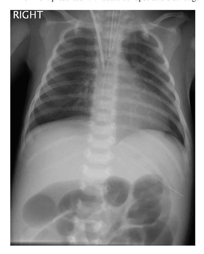
Figure 1. Chest radiograph showing dilated bowel loops in upper abdomen

The infant presented with acute collapse at a district gen-