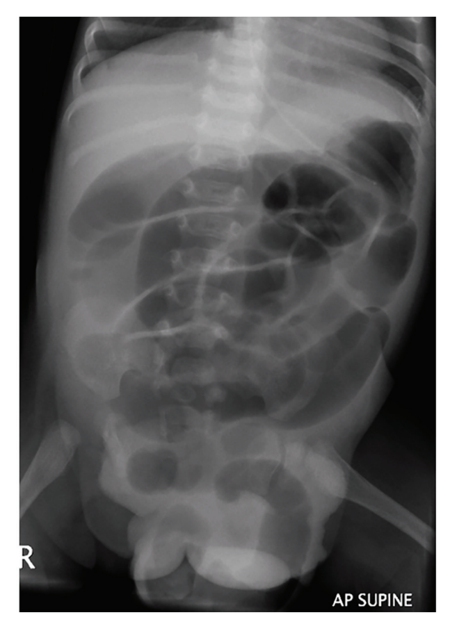
Figure 2. Abdominal radiograph demonstrated decompressed stomach, dilated bowel with vene conniventes and characterless loops and prolapsed loop through cloacal exstrophy. Note partial sacral dysgenesis, spina bifida and widening of the pubic symphysis in the background.

eral hospital associated with persistent crying, irritability, vomiting, absolute constipation, abdominal distension, collapse, dehydration, features of sepsis and concern about necrotic prolapsed bowel at the cloacal exstrophy. She weighed 2,570 g. The peripheries were cold and clammy. Necrotizing enterocolitis (NEC) was suspected. Initial fluid resuscitation 40 mL/kg and triple antibiotic treatment (cefotaxime, gentamycin and metronidazole) improved clinical condition.