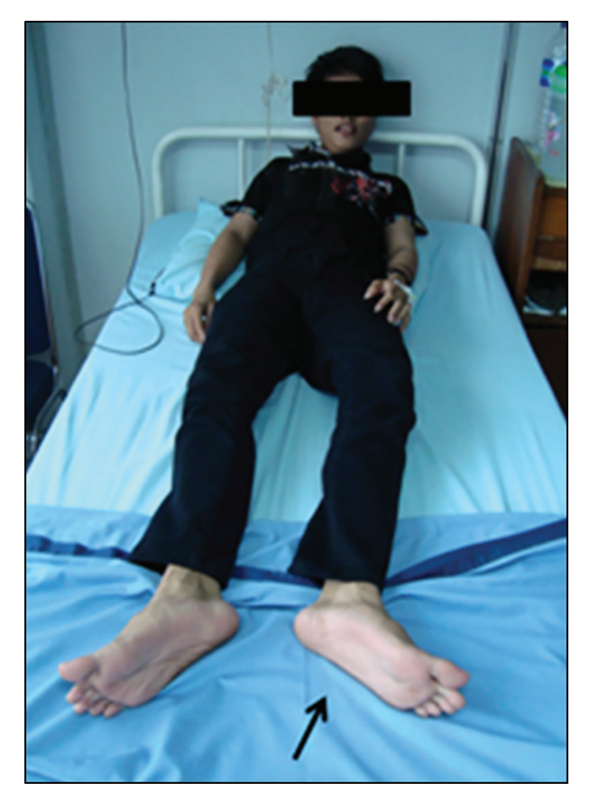
Figure 1. The photograph of the patient, please notice on foot weakness and both legs fell laterally (black arrow).